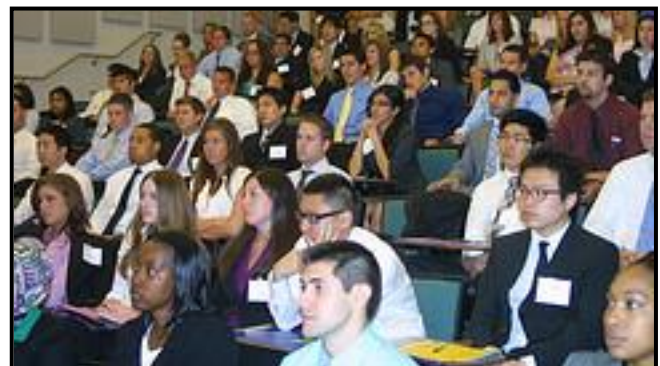
Students listen intently as they go through orientation.