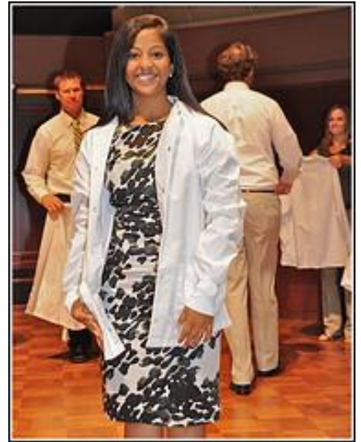
Students receive their white coats and eagerly await the beginning of classes.