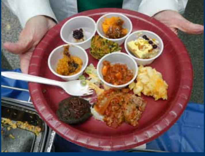
We are happy to announce the 2016 Taste Fest Winners!