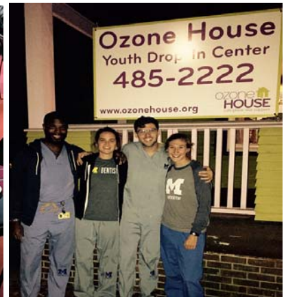
Ozone House's PrideZone meeting for LGBTQ+ youth.