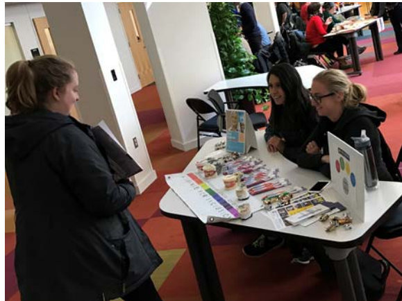
LGBTQ Health and Wellness Resource Fair— connected with members of the LGBT community.