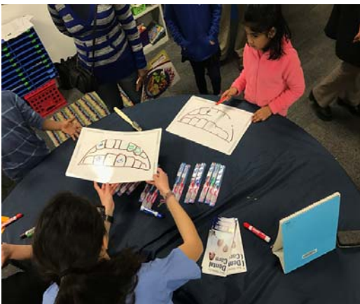
Canton Charter Academy Wellness Night— brush away sugar bugs with elementary school students

External Community Outreach to the Food Gatherers' kitchen at the Delonis Center, at the Canton Charter Academy Wellness night, the LGBTQ health and Wellness Resource Fair and the Ozone House's PrideZone event